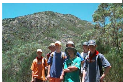
Those that made it.