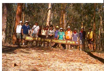
The Seniors who set out on the climb of Mount Barney.

Almost as hot today. The Seniors attacked Mount Barney at 0820 hrs with 14 taking the challenge . . . and then there was 12 . . . then 10 . . . then 8. . . Those 8 climbed and climbed and the water poured out of us faster than we could put it in. By the time we had reached Barney Saddle, we only had enough water for the return journey. Reluctantly, we turned back but not before seeing our goal of East Peak so near, yet so far. We would have had to walk a granite valley that would be like a furnace to reach. It was too dangerous. We descended four times the speed of ascent. Our parched bodies only cooled by a trickle of water at Cronin Creek. We staggered into Yellow Pinch, legs trembling from the descent to hear that Australia were all out for 554 and South Africa 4-57. Yipee!!! Alan Victor